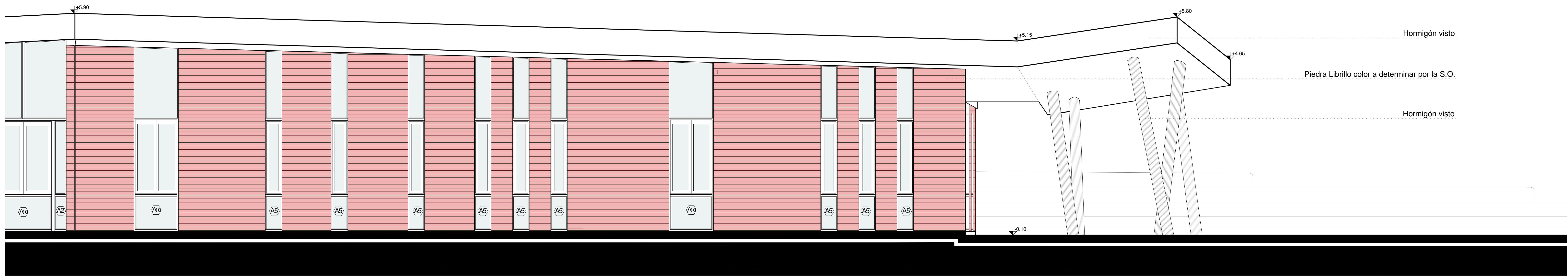
FACHADA SO - SECTOR 3